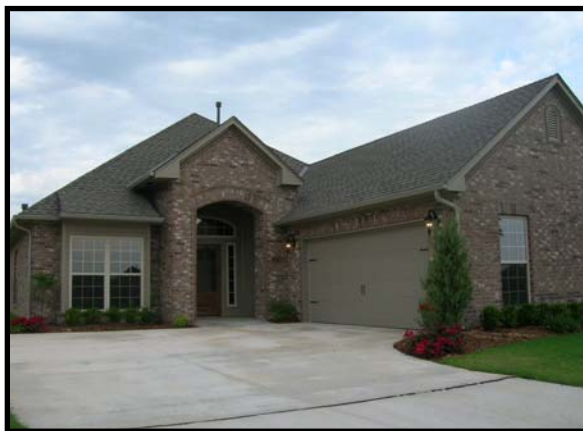
Discover the beauty and comfort of a Touchmark Parkview home.

An easygoing lifestyle is a unique quality of Touchmark living. People find it freeing to know that they don't have to deal with the daily hassles, such as lawn care and house-keeping, when they live in a Parkview home. Residents enjoy the availability of chef-prepared meals and other amenities, such as convenient banking, beauty salon services, a coffee shop, and Touchmark's Life Enrichment/Wellness program. A 24-hour concierge is available as well.