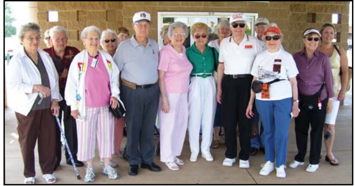
The group poses for a quick picture before boarding.